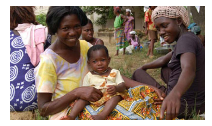
Ghanaian women falsely accused of witchcraft are finding their purpose and hope restored through Biblebased trauma healing.

In recent years, Lebanon has become a place of refuge for millions of Syrians and Palestinians fleeing the violence