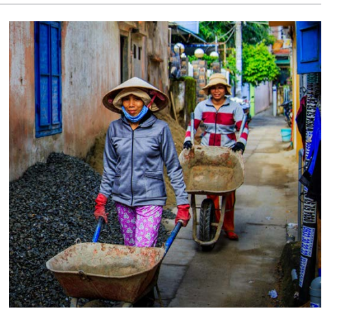
The deaf population in Vietnam is being invited to see that the Lord is good through new video Scripture translations

You can bring God's Word to life for people in China, visit ABSRecord.com/Bibles