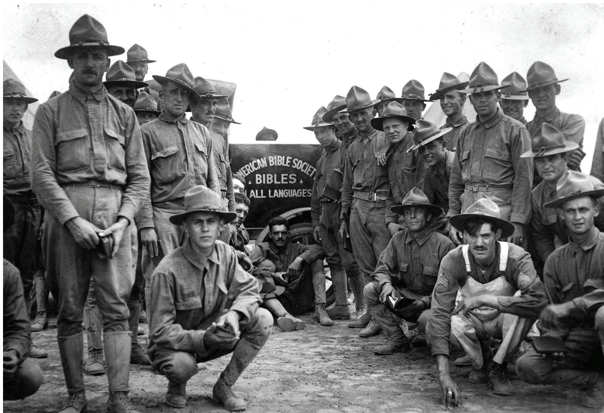
American Bible Society distributed millions of Scriptures to American soldiers during World War I.

With this look back, we remember God's faithfulness and our partners' generosity over the years.