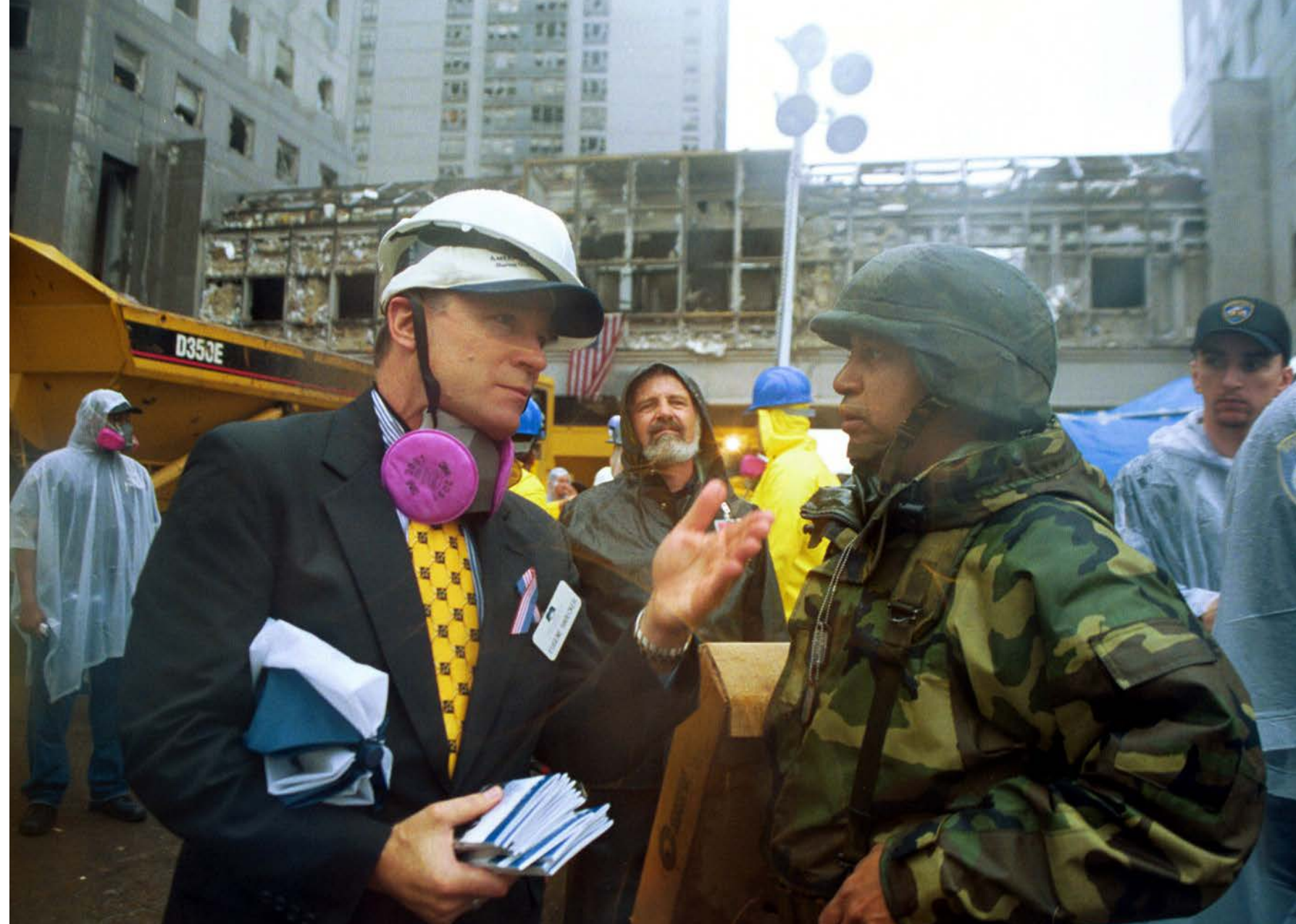
Former American Bible Society President Eugene Habecker handing out Scripture portions at Ground Zero following the 9/11 attacks.

For God’s people, the Soviet Union was a 69-year reign of terror. The USSR’s regime was marked by government propaganda, mass surveillance, and the imprisonment of dissidents—including journalists, scientists, and church leaders whose messages did not conform to the state’s narrow scope of acceptable opinions. Increasingly, religion was forced out of public life. Bibles were confiscated, ransacked, or destroyed. More than 100,000 Russian clergy were executed. Eventually, atheism was taught as a fact in public schools.