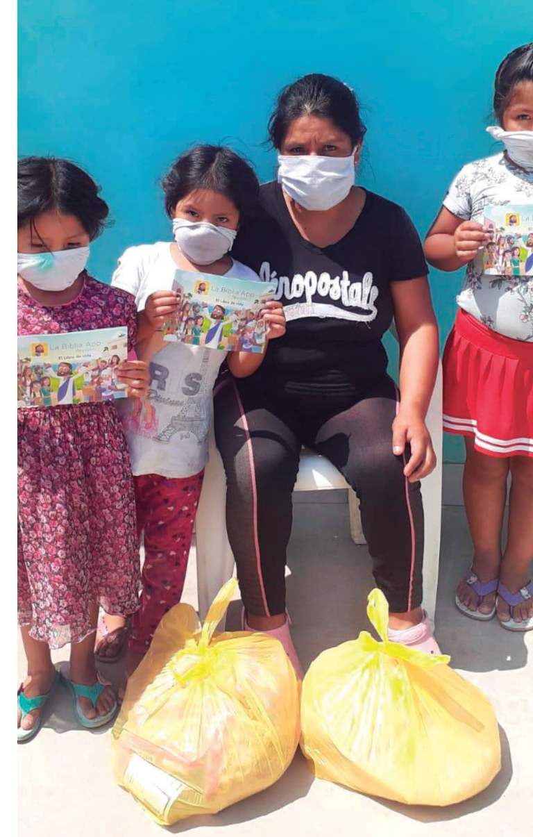
Nearly 1,000 rural families received food packages and Scriptures through Peruvian Bible Society’s Bread of Life ministry that provides a daily meal and Bible lesson for at-risk children.

The Bible Society assembled a team of volunteers to mask up and distribute Scripture