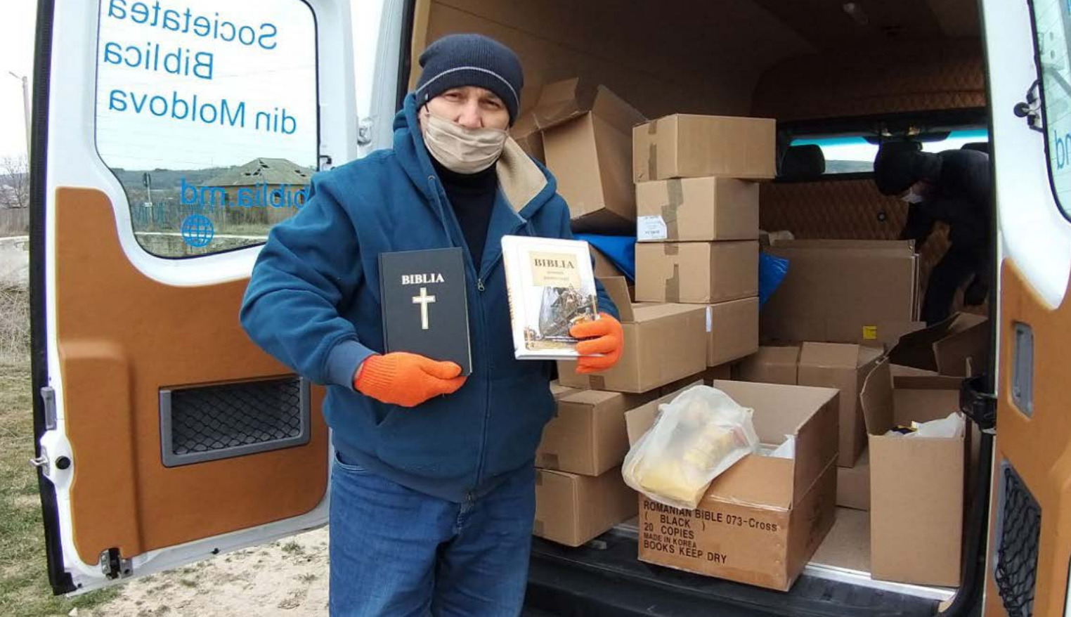
Moldovan Bible Society provided 300 food baskets and Bibles to families in two quarantined villages. One mayor fell on his knees with tears in his eyes to say, “Thank you very much!”