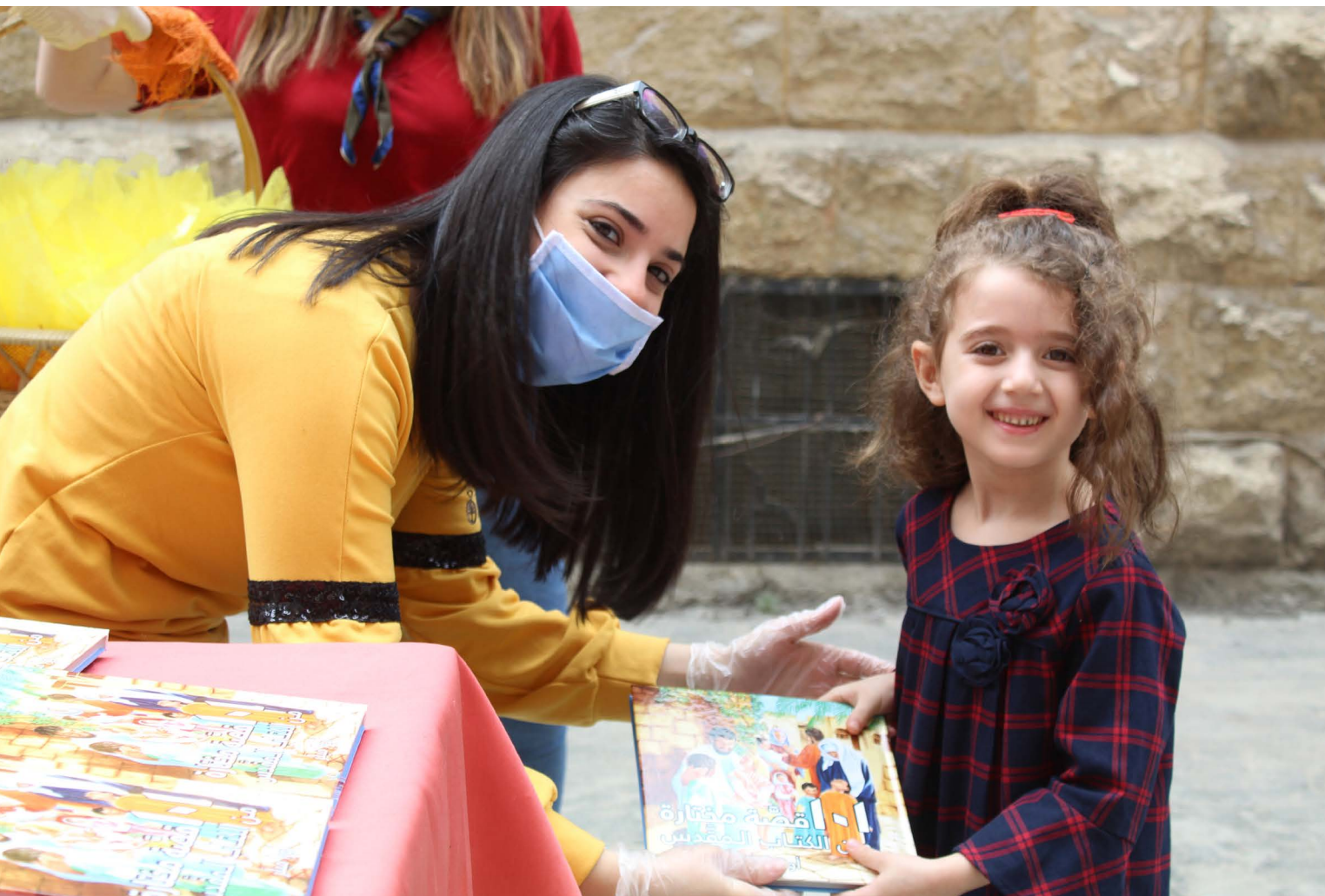
Despite restrictions, Bible Society in Syria was able to continue its children’s outreach at Easter—sharing the peace of Jesus with 28,000 children!

“Jesus loves you” is particularly profound. COVID-19 has put additional pressure on these “street children” who typically survive off scraps from dumpsters. When Kenya’s government closed restaurants and hotels to curb the spread of the disease, those establishments stopped throwing out their excess food. Janet, a young teenage mother living on the streets in Nairobi, Kenya, said, “We have been sleeping hungry because the rubbish bins have become empty.”