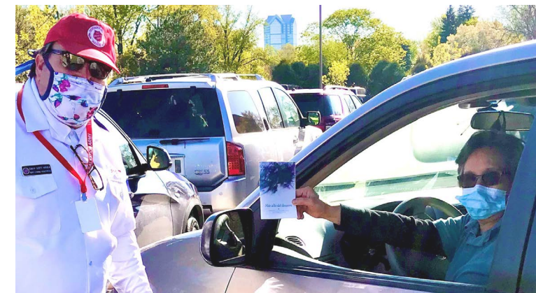
This year, 70,200 families received Scripture with their groceries through a partnership between American Bible Society and The Salvation Army.

Bible Society in the Gulf serves these communities, publishing and distributing Scripture in 60 languages. Through your support, at the beginning of 2020, more than 20,000 people in the Gulf received Scripture in their languages such as Tagalog, Telugu, Tamil, Urdu, Nepali, and Arabic. In times like these when migrant workers could be most fearful of their circumstances and their future, Scripture allows them to instead find solace in the Lord.